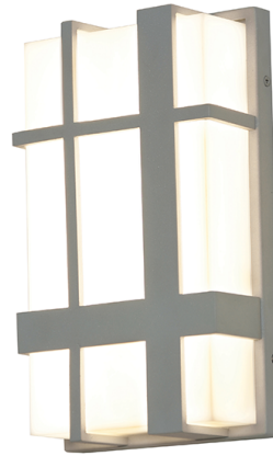
12" Textured Grey

Specifications and dimensions subject to change without notice.