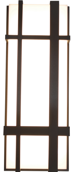
18" Textured Bronze